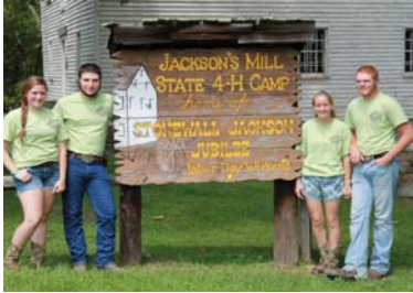
2015 Ohio Winning Team Sheridan High School

*Youth must be 14-18 years old as of Jan. 1