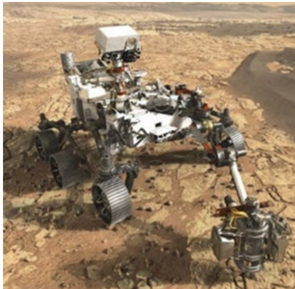
Perseverance rover

Perseverance is designed with a helicopter attached to it. This will aid the rover in locating and flying to a specific landing spot. Pretty cool!!