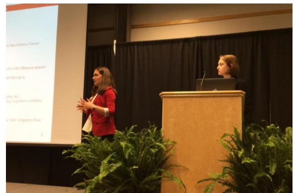
TLC Members are advocating for the Ohio 4-H Program during a presentation.

Our Morale Committee is working on preparing a mock speed dating activity for our July meeting. They will also be passing out virtue cards. Our Communications Committee is continuing to publish monthly newsletters and planning to work on various other projects, including a TLC Video and a session about communication at our July meeting.