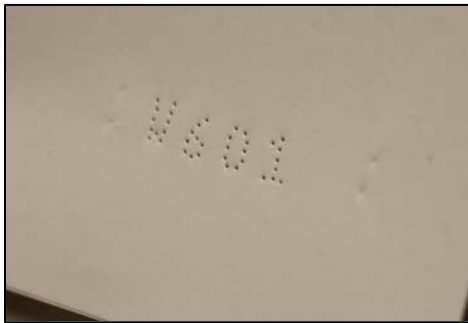
The digits in order on paper