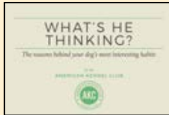
WHAT'S HE THINKING?