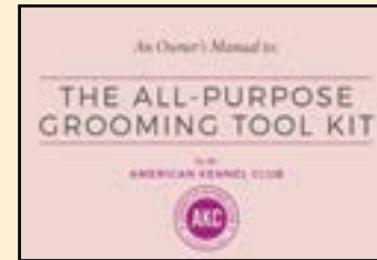
THE ALL-PURPOSE GROOMING TOOL KIT