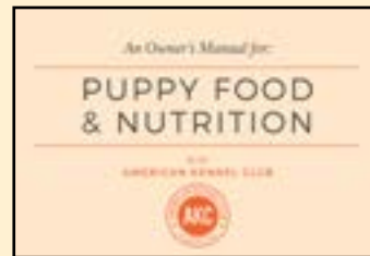
PUPPY FOOD & NUTRITION