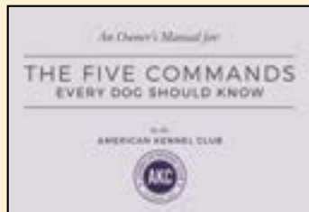
THE FIVE COMMANDS EVERY DOG SHOULD KNOW

We hope this information was valuable to you in helping your puppy live a long, healthy, happy life. Below, find additional books in our Owner's Manual series designed to strengthen the bond between you and your furry family member.