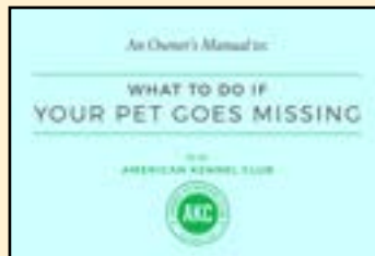
WHAT TO DO IF YOUR PET GOES MISSING