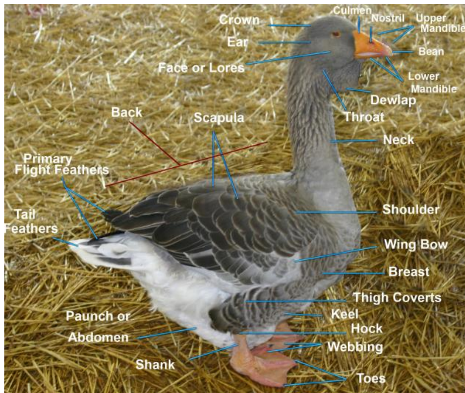
Fig. 1. Parts of a male Toulouse goose.

Geese have many of the same basic external parts as ducks and other fowl, such as chickens . Figure 1 illustrates the external parts of a goose's body. Some breeds of geese have features that others do not. For example, as shown in Figure 2, some breeds have a horny knob at the base of the bill and/or a dewlap , which is a loose growth of skin extending from the base of the lower bill to the upper throat.