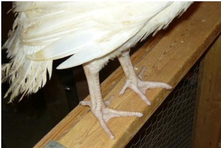
Fig. 1. Six-week-old turkey whose toes have been trimmed.

Although toe trimming causes pain early in a bird's life, birds whose toes are trimmed may have lower stress and fearfulness later due to reduced incidence of physical injury from sharp claws of pen mates when the birds become excited.