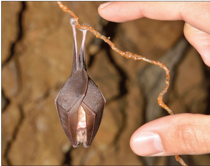
The lesser horseshoe bat gets its name from the shape of its nose.

which benefit from them in many ways. Many ecosystems would eventually fail if bats no longer pollinated their plants and spread plant seeds. Learning about these amazing animals allows us to better understand how to help them.