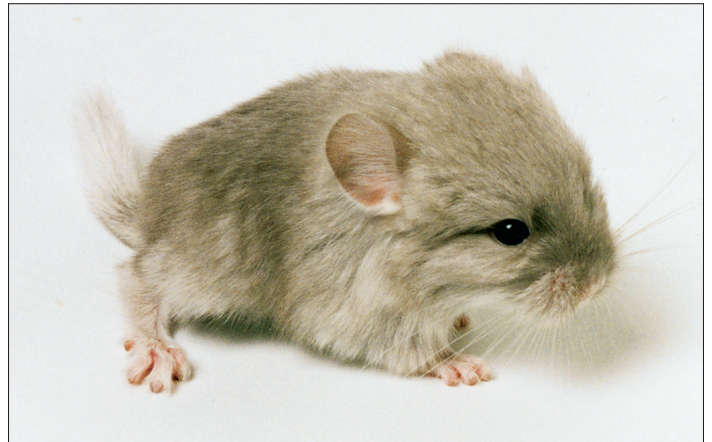
One-week old chinchilla.

Chinchillas are most comfortable at a constant temperature of 50–55 degrees Fahrenheit; therefore, they should be caged as indoor house pets. Adults can tolerate temperatures just above freezing, but they do not do well in stagnant or drafty areas. The chinchilla is sensitive to heat and is stressed by temperatures hotter than 80 degrees Fahrenheit.