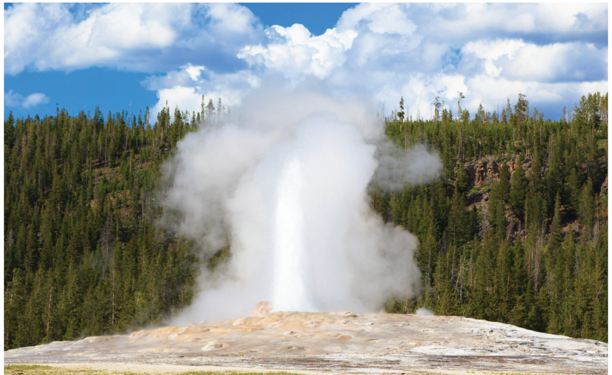
The Old Faithful Geyser hosts the same heat-loving thermophilic bacteria as compost piles.

When you build a compost pile, a good size to start with is between 3 x 3 x 3 feet (one cubic yard) and 5 x 5 x 5 feet across. This is big enough for the materials to develop a hot center with a cool outside layer. It is also a manageable size to turn easily. The pile's temperature cools as decomposers use water, air, and food. That's your signal to add more materials and turn the pile. Mixing the pile's materials helps them breakdown more evenly.