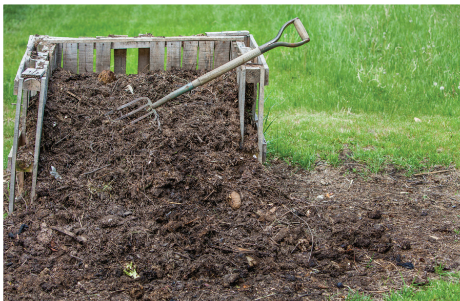
This compost has reached the humus stage and is ready to use.