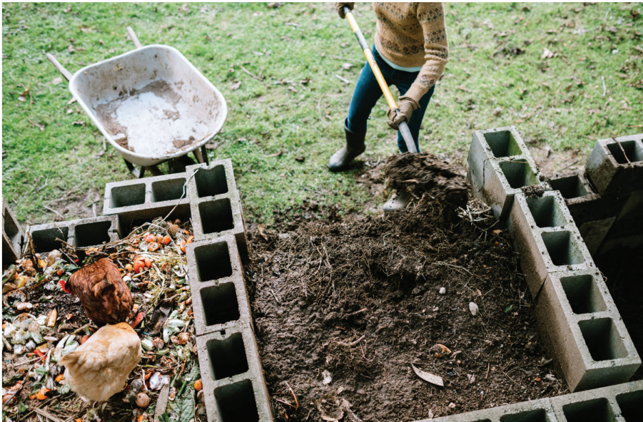
Chickens snack on fresh items of a newer pile that's next to a pile of finely textured finished compost.