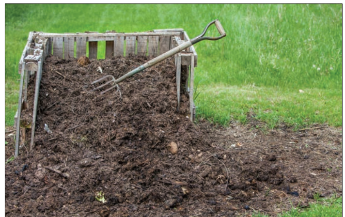
This compost has reached the humus stage and is ready to use.