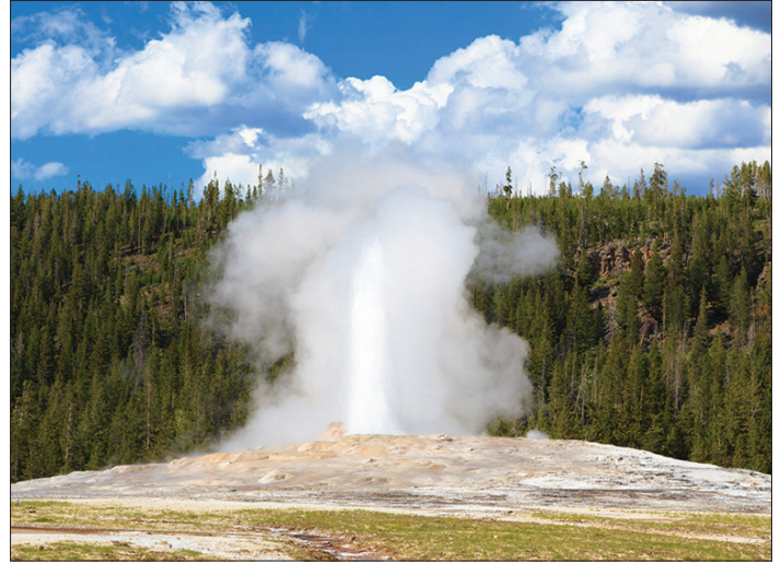
The Old Faithful Geyser hosts the same heat-loving thermophilic bacteria as compost piles.

When you build a compost pile, a good size to start with is between 3 x 3 x 3 feet (one cubic yard) and 5 x 5 x 5 feet across. This is big enough for the materials to develop a hot center with a cool outside layer. It is also a manageable size to turn easily. The pile's temperature cools as decomposers use water, air, and food. That is your signal to add more materials and turn the pile. Mixing the pile's materials helps them breakdown more evenly.