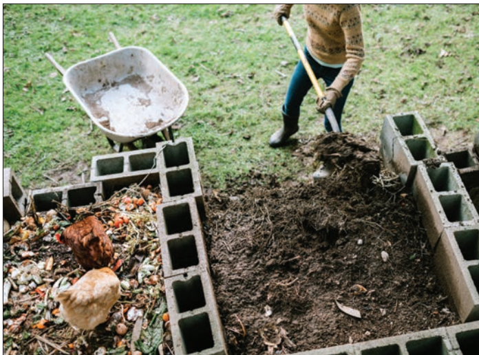
The Old Faithful Geyser hosts the same heat-loving thermophilic bacteria as compost piles.

The more greens you have in your pile, the less water you need. In some cases your pile will be too wet, and you may need to add leaf matter, shredded paper, or other dryer materials that can soak up excess moisture. If you get a lot of rain, a layer of straw or a tarp on top of your pile will protect it from getting too wet.