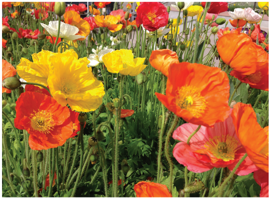
Some poppies are annuals and some are perennials.

shrubs, many of which have interesting branches that can be used in your fresh flower arrangements. Bulbs and bulblike plants—such as corms, tubers and rhizomes—produce beautiful flowers for landscape or container use. You will discover exotic plants, such as tropical, too. Some are hardy and others need to be dug and brought inside for protection during the winter.