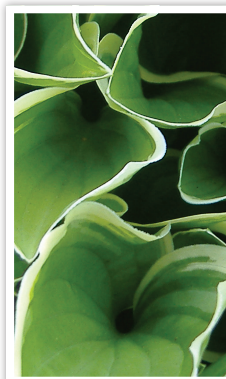
Hostas are perennials often used as accents in flower gardening.