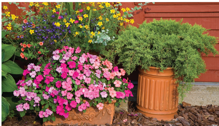
Group several containers of flowers to create a pleasing display.