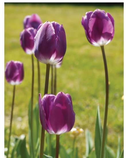
Tulips are bulbs that can be grown in gardens or containers.

so that you can plan your purchases. Notes about insects, diseases and any other problems can help you deal with them as you determine patterns and plan ahead for pest management strategies. Include pictures of your plants and garden. They are helpful reminders when planning future garden projects.